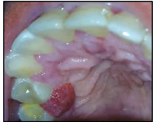
Figure 3. Intraoral photographs of PT (case 4); a sessile soft lobulated reddish lesion of upper palatal posterior gingiva.

consistency, while one (25%) lesion was firm. The color of the lesion in half (50%) of PT cases at the time of referral was pinkish-red, whereas the other half (50%) of the lesion showed reddish color. All PT cases were not ulcerative.